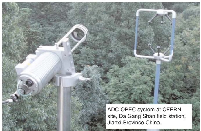
ADC OPEC system at CFERN site, Da Gang Shan field station, Jianxi Province China.