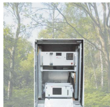
CPS12 CO 2 multi-point profiling system