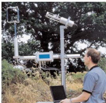
OPEC Open path eddy covariance system