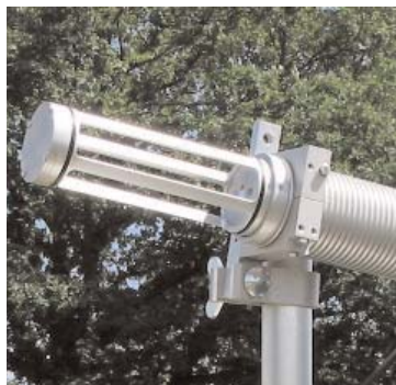
OP-2 Open path CO 2 / H 2 O analyzer

A range of high performance gas exchange instrumentation for ecophysiological research applications